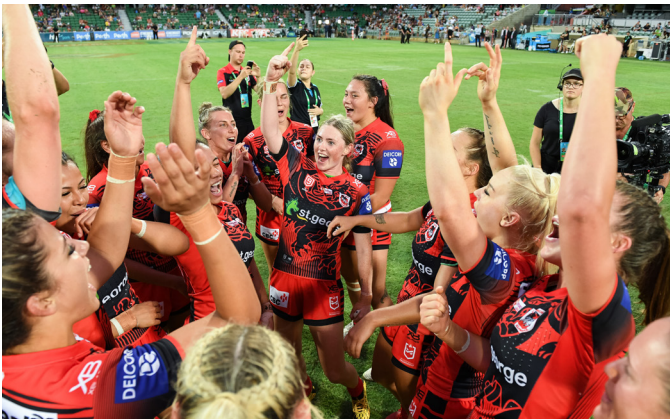
HAPPIER TIMES - NRLW NINES WIN