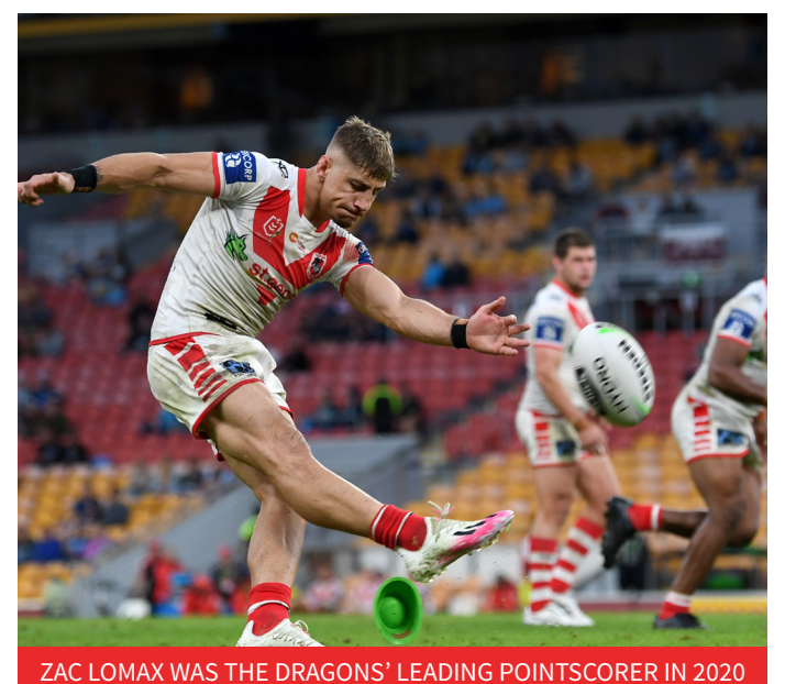
ZAC LOMAX WAS THE DRAGONS' LEADING POINTSCORER IN 2020