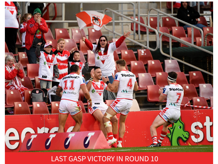
LAST GASP VICTORY IN ROUND 10