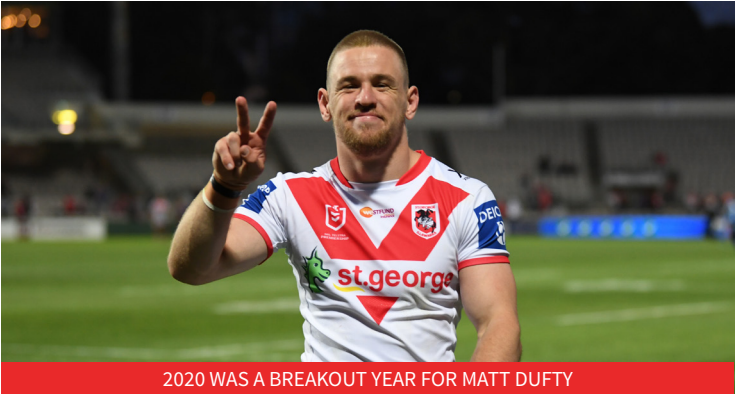
2020 WAS A BREAKOUT YEAR FOR MATT DUFTY