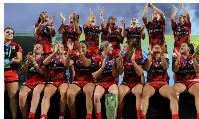
THE NRLW NINES WIN PROVED A 2020 HIGHLIGHT

From a merchandise perspective, our online sales were a highlight which can be attributed to our revamped online team store, a stronger focus on our digital marketing and the general shift towards online shopping by consumers. The indigenous jersey was a tremendous piece of apparel that was a highlight of our range in 2020. The response from players and the public was overwhelming as it is great to have something carry such meaning and resonate with so many people.